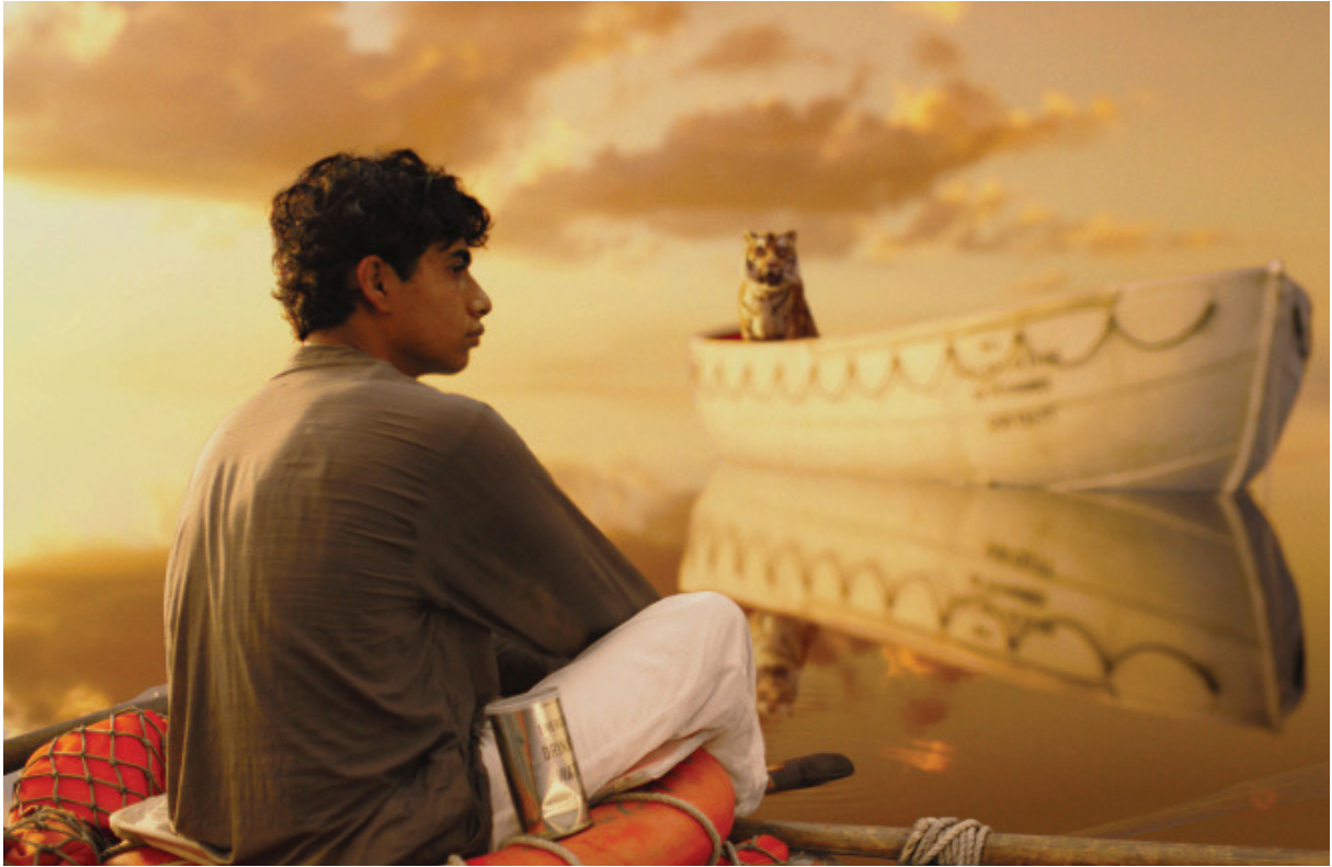
My fellow castaway came into view

and brought me a small measure of comfort, though I couldn't recall for the life of me what Plan Number Six was. Warmth started coming to my bones. I closed the rain catcher. I wrapped myself with the blanket and curled up on my side in such a way that no part of me touched the water. I fell asleep. I don't know how long I slept. It was mid-morning when I awoke, and hot. The blanket was nearly dry. It had been a brief bout of deep sleep. I lifted myself onto an elbow.